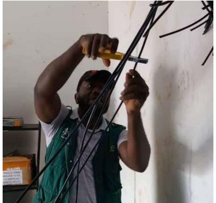
A Copyright Inspector disconnecting cables being used for illicit transmission of paid TV signals, during an antipiracy raid of the Real Summit Television Station, Ugwuoye Nsukka, Enugu State on 21st September 2022.