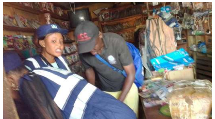
NCC Copyright Inspectors packing suspected optical discs during an anti-piracy operation in Benin on 14th September 2022.