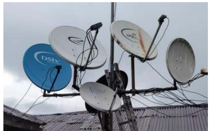
The cable piracy base station raided by NCC operatives in Port Harcourt on 16th -17th September 2022.