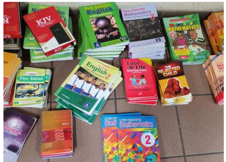
Samples of suspected pirated books impounded by Copyright Inspectors during an antipiracy operation in Mpape Old and New Markets, Abuja on 11th August 2022.